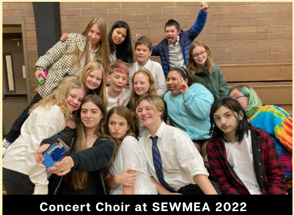
Concert Choir at SEWMEA 2022