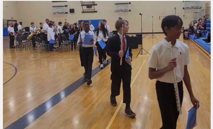
Band concert snapshot, above Orchestra practicing together, below