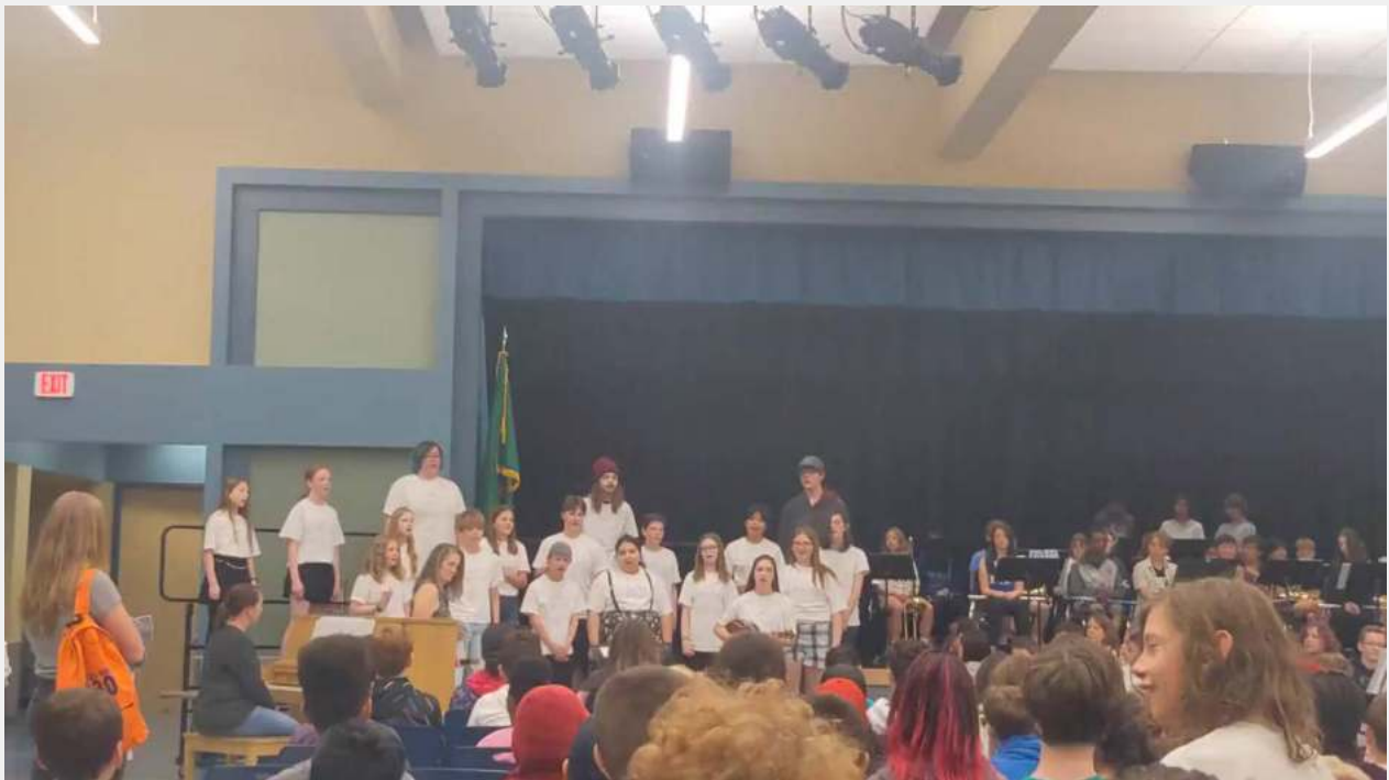
7/8 Concert Choir performing for incoming 5th grade students